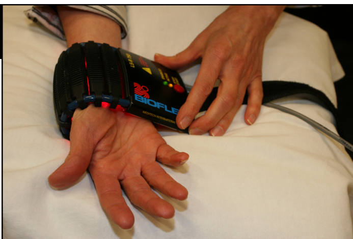
Part of laser therapy involves placing a red-light emitting diode over the affected area. Laser therapy is painless and has no known serious side effects.